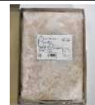
PD Vannamei Shrimp (Vacuum Pack)*Soaking