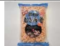
Cooked PUD Vannamei Shrimp (IQF)*Soaking It ' s already cooked, so it ' s very easy!!